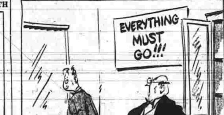
EVERYTHING MUST GO!!