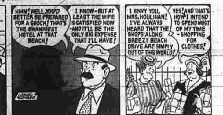
BOOTS AND HER BUDDIES