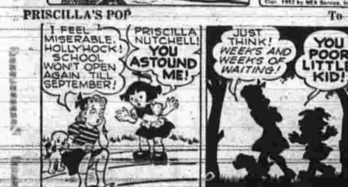
To Each His Own