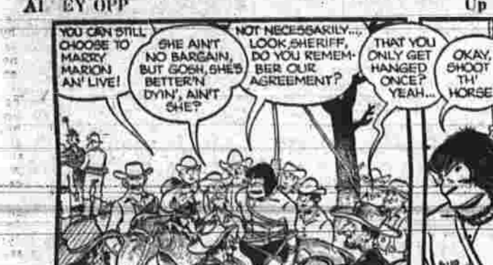
Up You Go, Pal